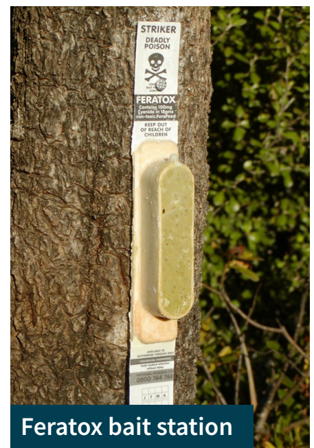
Feratox bait station