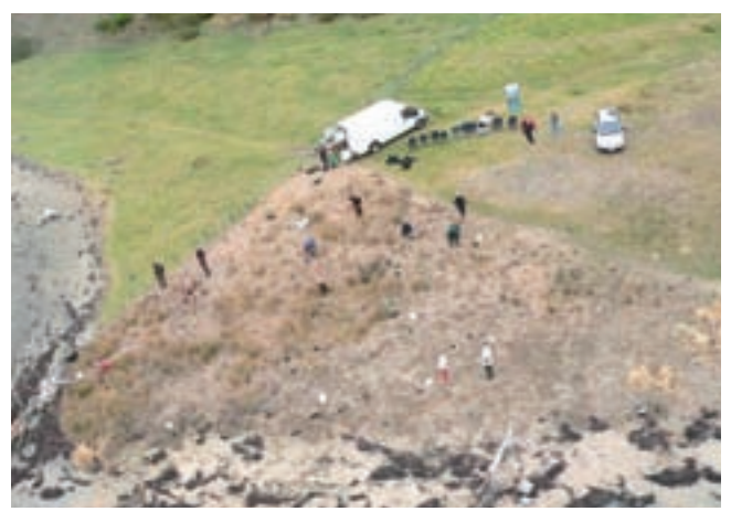
Spinifex planting in Whitireia Park