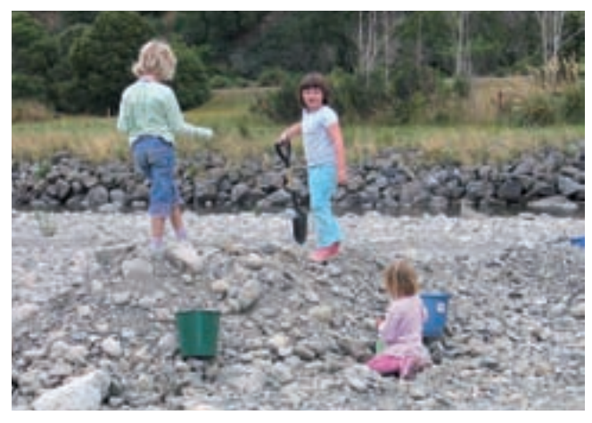
ROP Hutt Great Gravel Grab