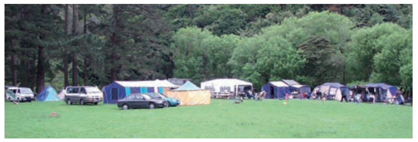
Camping at Battle Hill