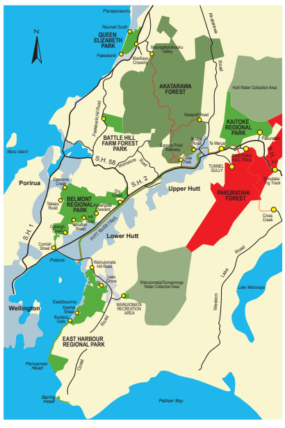
Area: just over 6,888 hectares