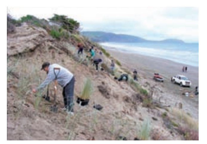
Planting on the dunes