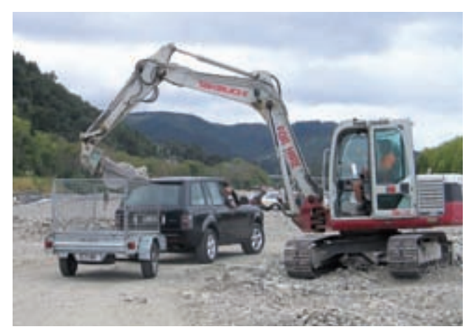
ROP Hutt Great Gravel Grab