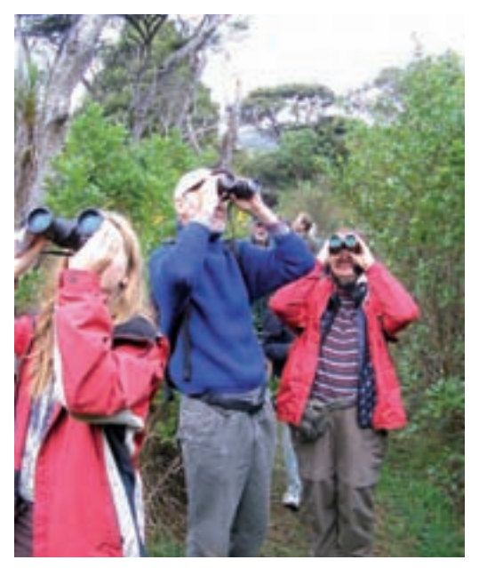
Twitching (bird-watching) on the Coast – Queen Elizabeth Park

The range of activities enjoyed in the regional parks continues to grow. Walking is still the most popular pastime but we have seen significant growth in mountain biking and events from a few years ago.