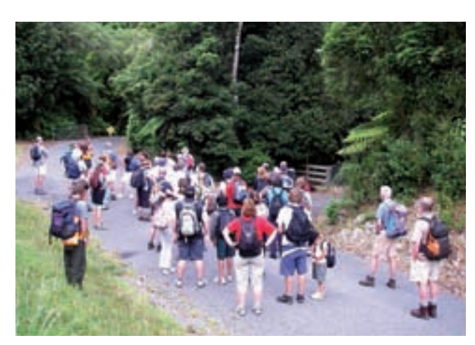
ROP Water Catchment walk