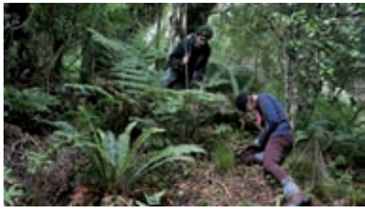
Monitoring seedling growth

An extensive pest monitoring and ecosystem assessment programme is run in conjunction with the pest control programmes. Monitoring of pests first determines the effectiveness of control operations and then whether population levels are rising above pre-determined thresholds.