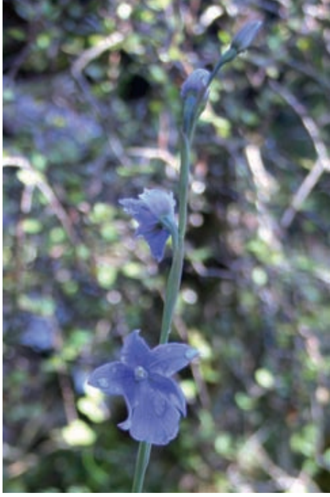
Thelymitra cyanea striped sun orchid