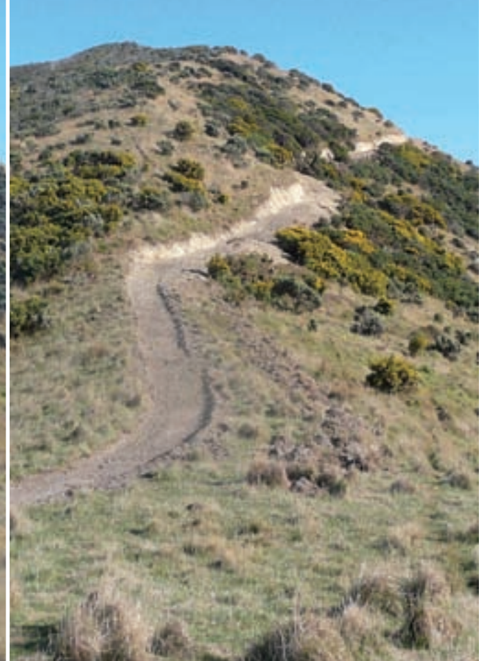
Before the track from the Kohangatera lookout to the wetlands was constructed...