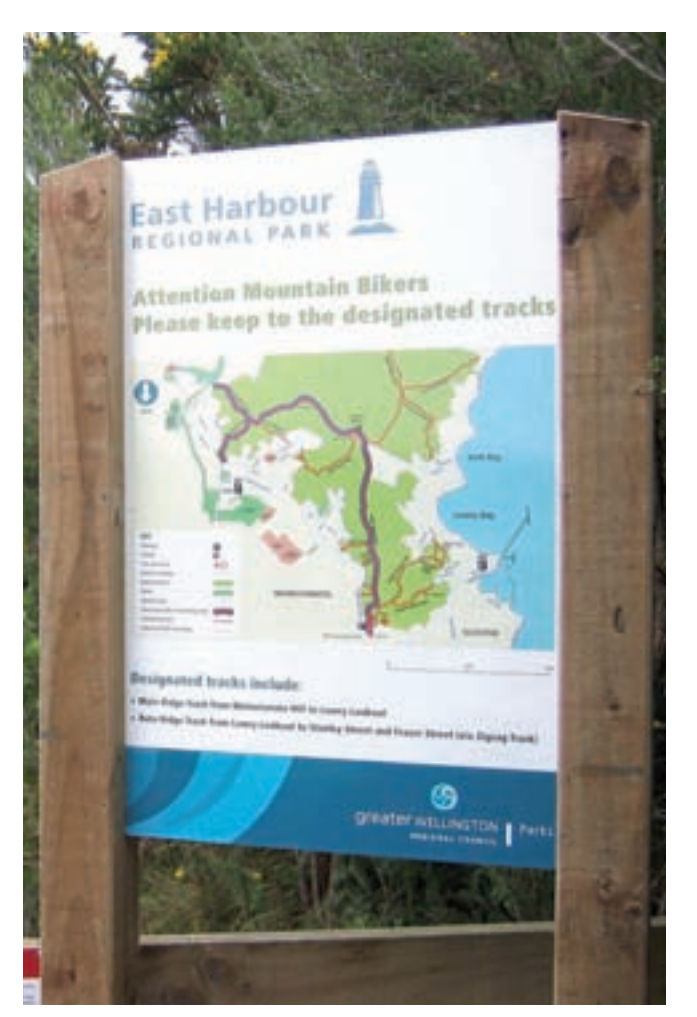
Mountain bike information panel