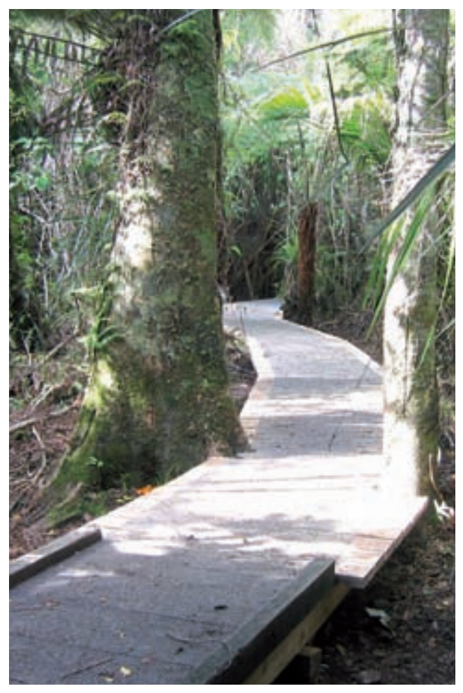
New boardwalk in Butterfly Creek valley