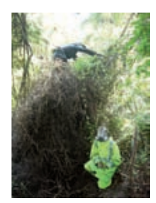
Controlling Japanese honeysuckle

Both pest animals and plants are more intensively controlled within two "mainland island" projects. One is within the upper Wainuiomata River catchment and the other is in the Gollans Stream catchment in East Harbour Regional Park. The aim of these projects is to protect the greater biodiversity values present and to further restore the areas to a semblance of their original character and condition.