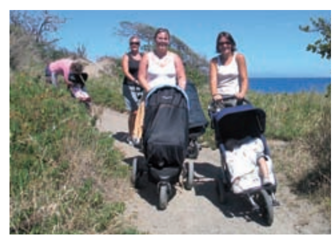
ROP Buggy walk