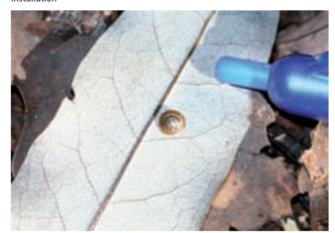
Native snail on Tawa leaf