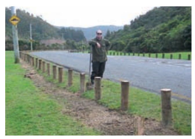
more permanent bollards were installed