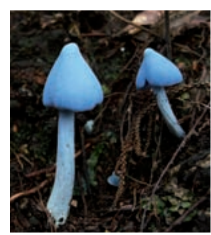
Sky blue mushroom (Entoloma species)