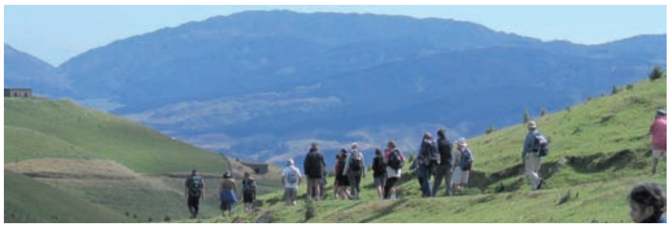
ROP participants in an Explore Belmont event