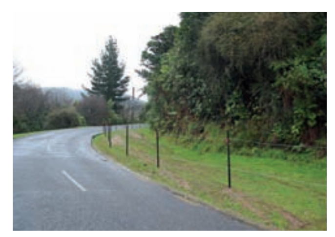
A temporary fence was put in before...