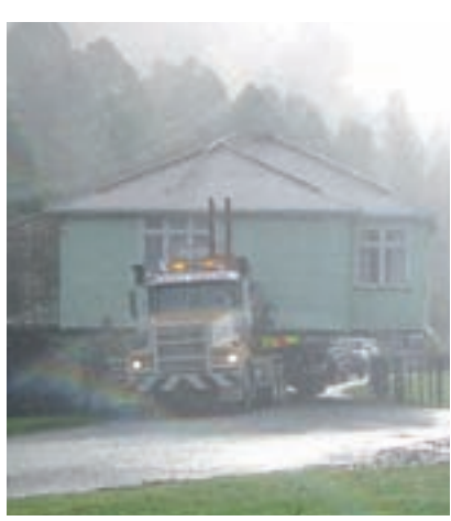
Wainui site office was relocated