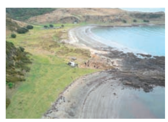
Spinifex planting in Whitireia Park