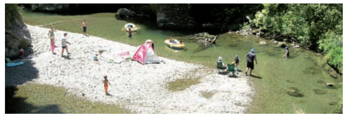
Summer fun in Kaitoke