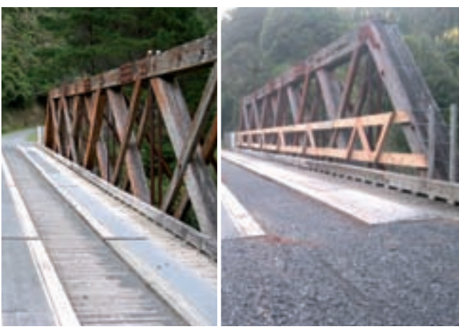
Pakuratahi Truss Bridge before handrail...