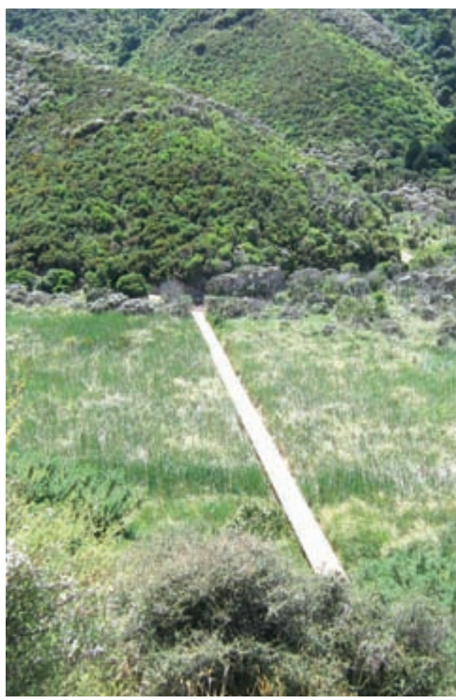
Boardwalk over Gollans Stream wetland