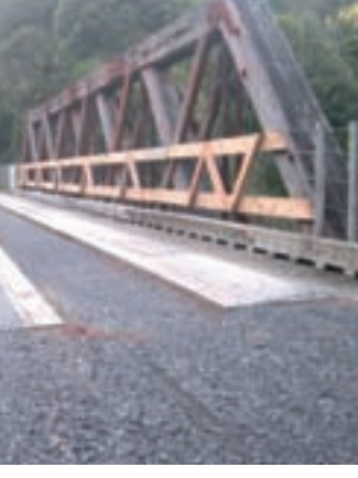
and after handrail installed