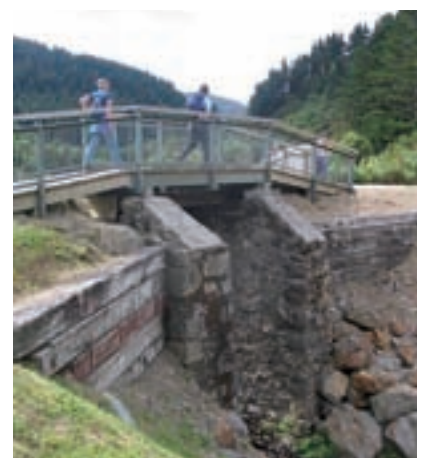
ROP Rimutaka Rail Trail participants