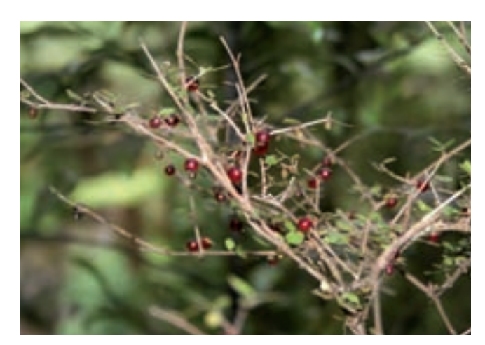
Coprosma rhamnoides berries