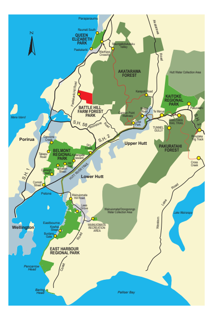
Park Area: 502 hectares