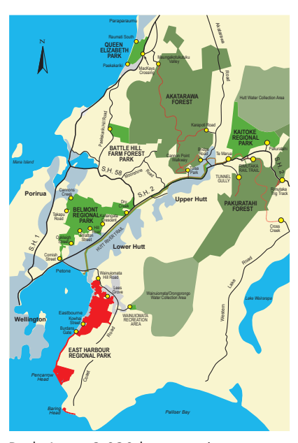
Park Area: 2,020 hectares in three separate blocks