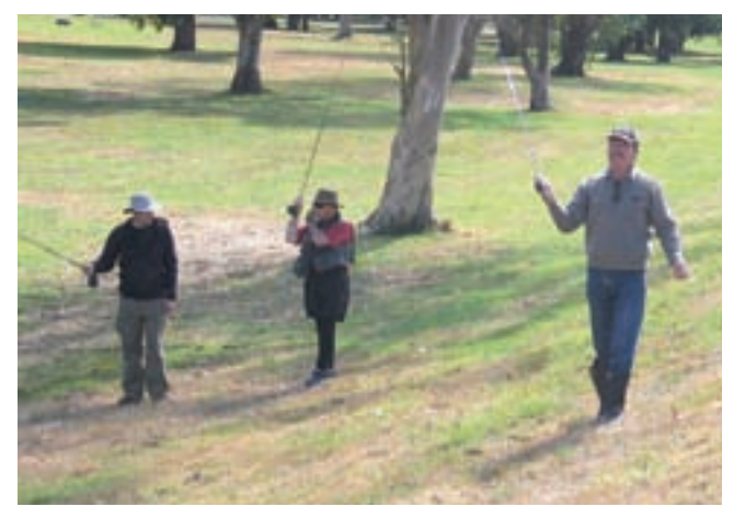
ROP participants learning to fly fish