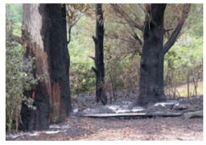
Results of a fire set by vandals in Tunnel Gully