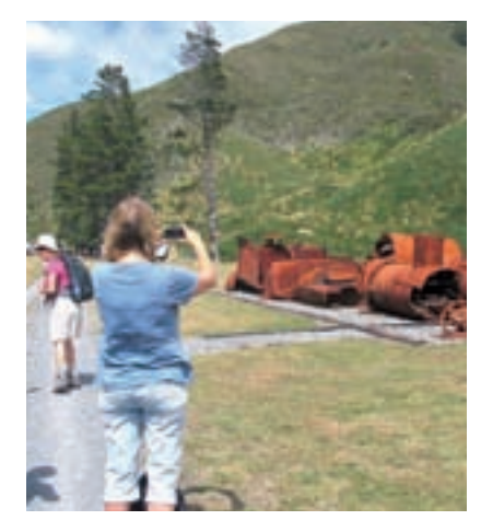
ROP Rimutaka Rail Trail