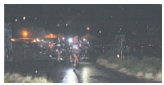
Night Time Madness event

Beech/rata on the hills and lowland podocarp / broadleaf in the valleys of the Northern Forest provide the eastern backdrop to Wellington harbour and excellent walking, tramping and picnicking opportunities. The Parangarahu (formerly Pencarrow) Lakes Area contains the nationally significant freshwater Lakes Kohangapiripiri and Kohangatera, home to a wealth of native plants and wildlife. The Mainland Island Restoration Operation (MIRO) maintain an intensive pest control network in the Northern Forest.