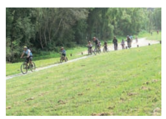
ROP Bike the Trail