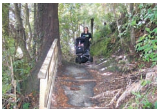
Tree root filled in on Tane's Track to improve access