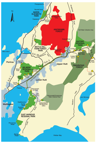
Park Area: 15,400 hectares