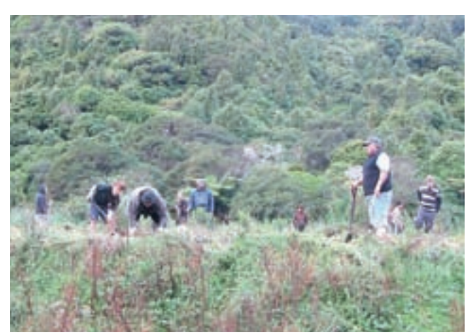
Planting on lower dam site