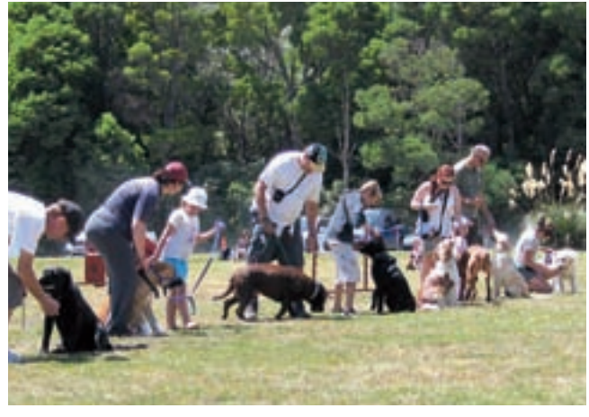
ROP Paws in the Park