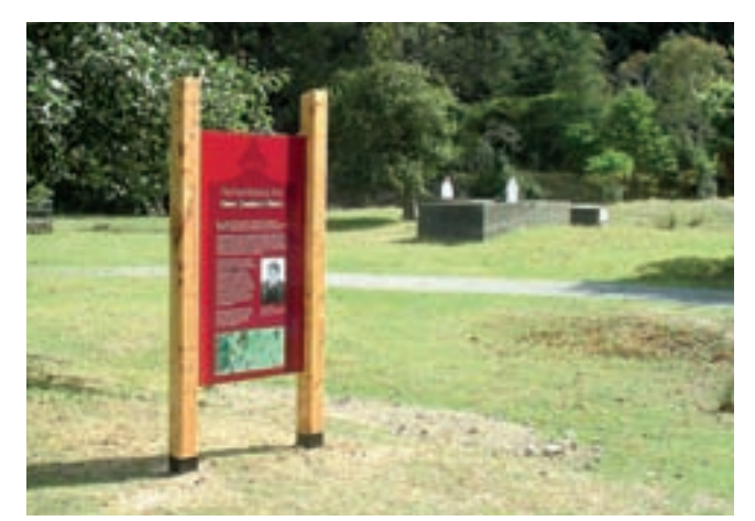
Heritage Trail signage