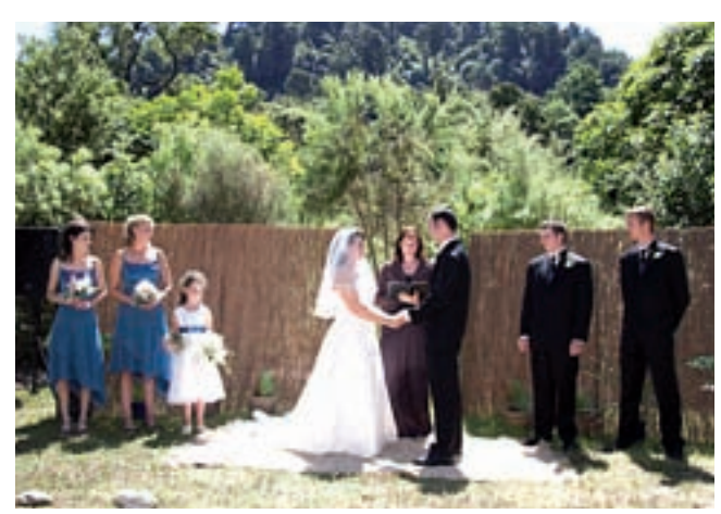
One of three weddings held in the Park