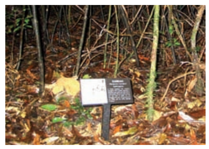
Environmental education signs