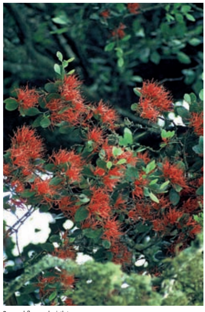
Rare red-flowered mistletoe