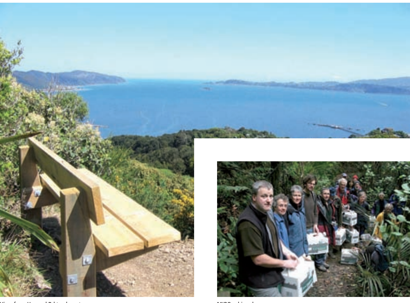
15 View from Howard Rd track seat MIRO robin release