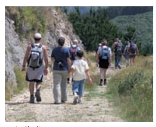
Battle Hill Heli-Tramp

Of the features most valued by park visitors, the flora or native bush are recurring themes. Visitors cite the opportunity to get in touch with nature and the outdoors as one of the main benefits they receive from visiting the regional parks.