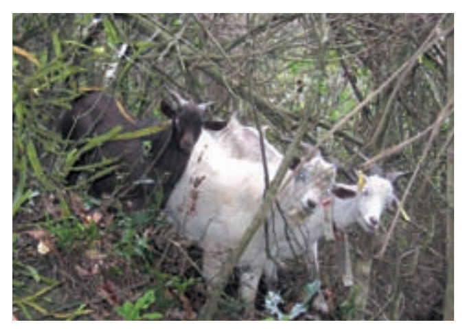
Goats with a "judas" goat