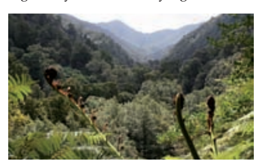
Upper Eastern Hutt

Greater Wellington's parks, forests and water collection areas contain many remarkable and significant natural ecosystems. Among these are magnificent lowland podocarp forests, ecologically important rivers and streams, and regionally and nationally significant wetlands.