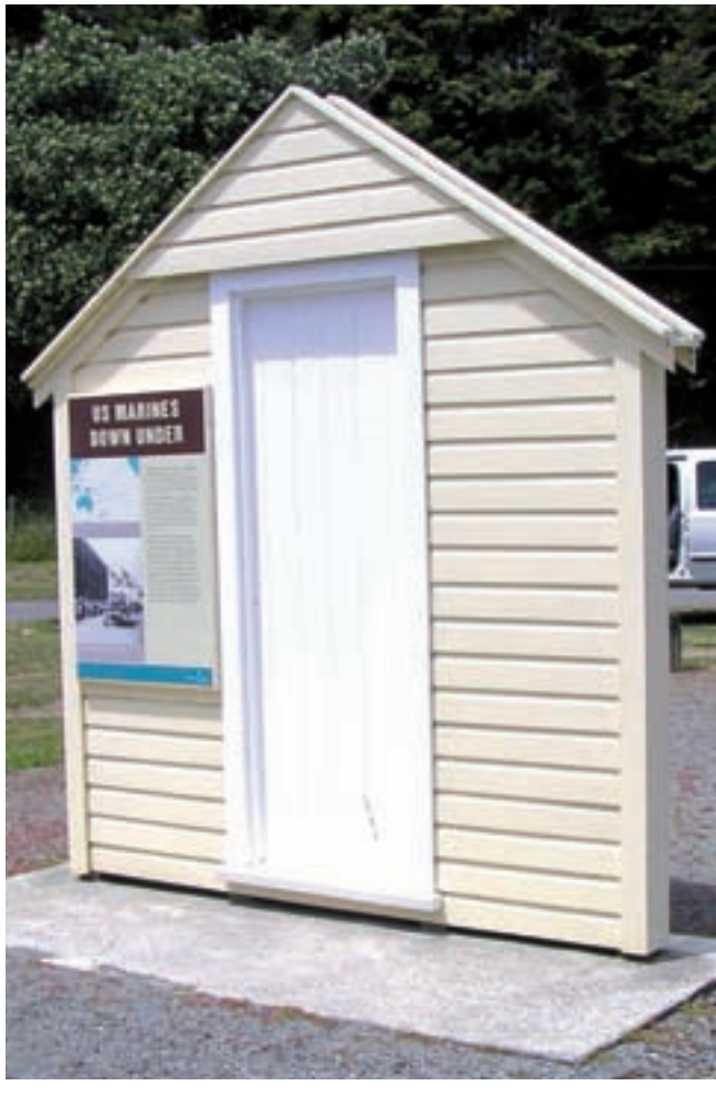
US Marines information panel