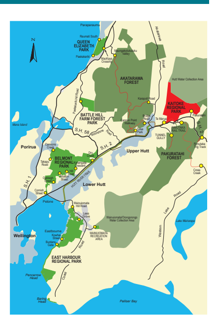
Park Area: 2,861 hectares