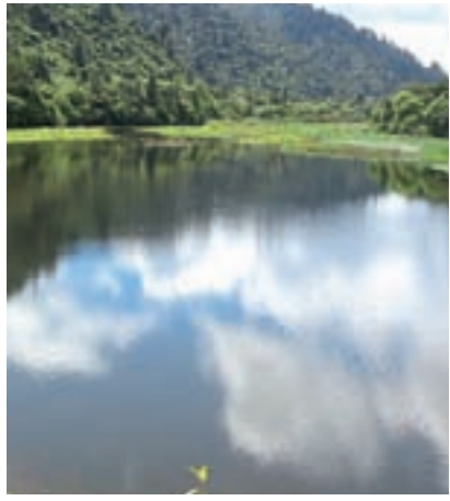
Lower Dam finally full