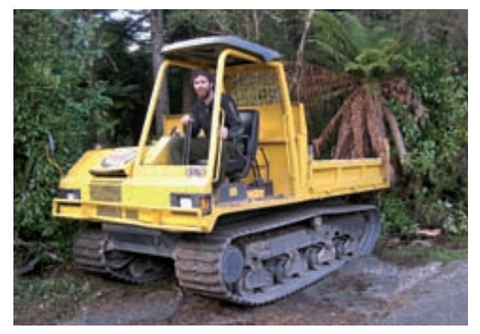
A motorised wheelbarrow also helped with the Orange Hut toilet installation