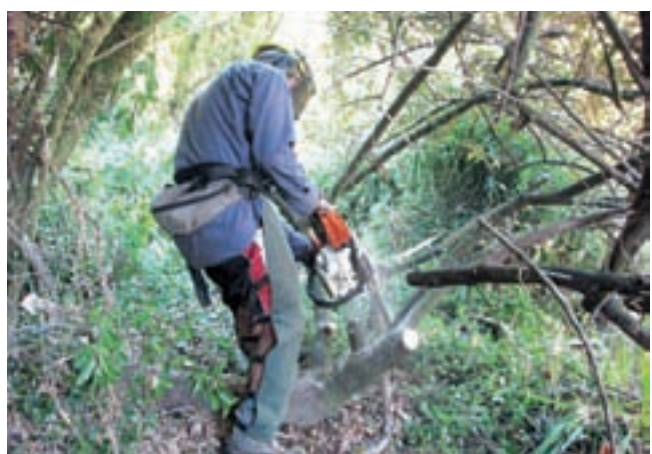
Controlling elaeagnus in the Korokoro area