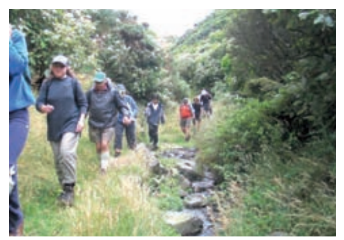
ROP participants at Dry Creek