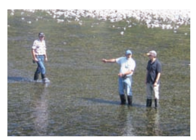
ROP participants learning to fly fish