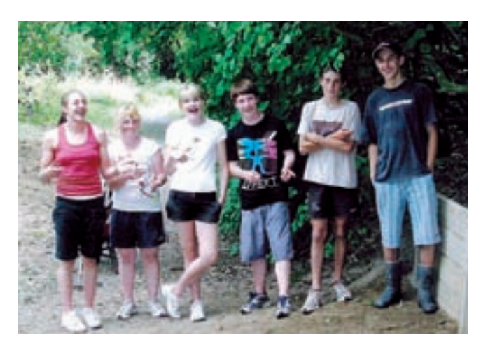
Hillary Challenge team from Kapiti College