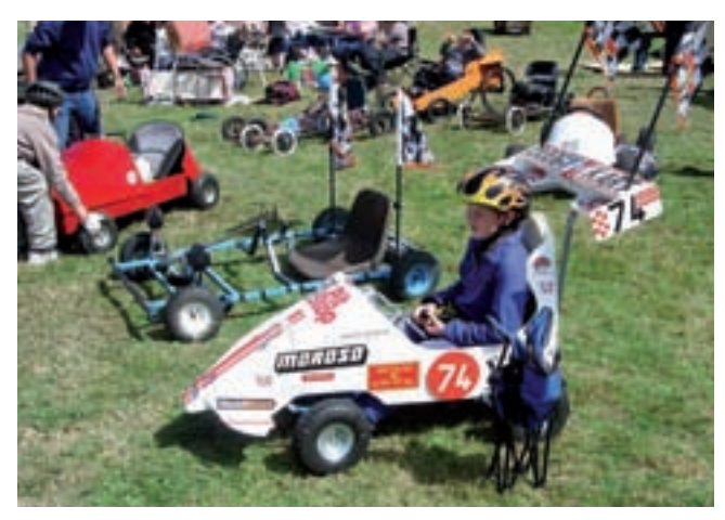
St Josephs Scouts trolley derby