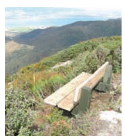
Rimutaka Trig Track seat