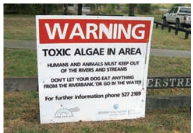
Toxic algae warning sign