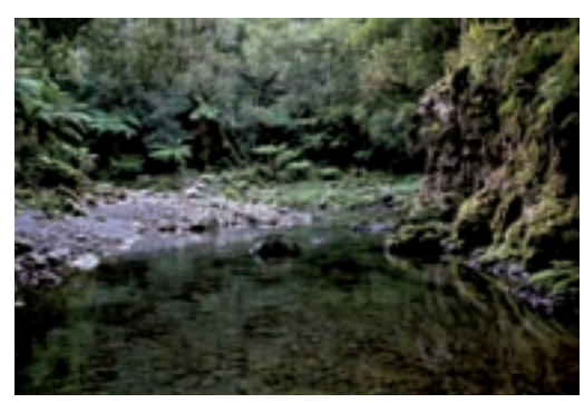
Upper Western Hutt river