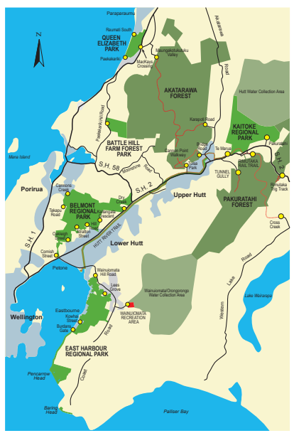
Area: 338 hectares