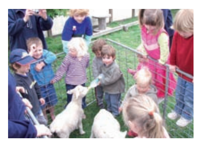
Day-care children feeding lambs