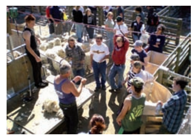
Outstanding in the Field participants