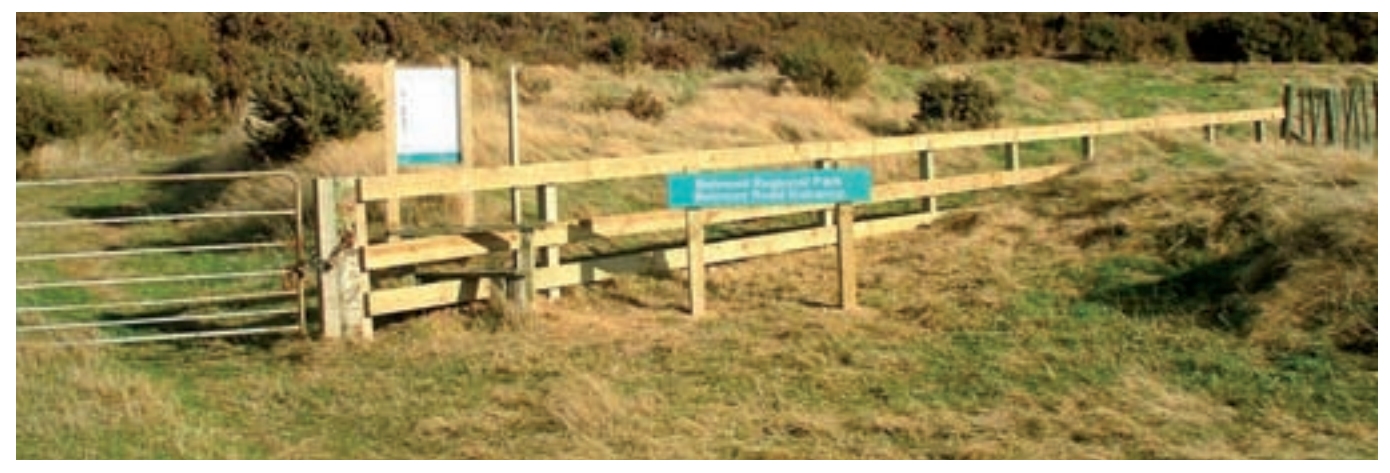
New signage, gate and stile