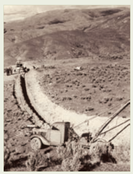
Laying of the Porirua branch line off the Kaitoke-to-Karori water main.

The route chosen was to go through the upper Hutt Valley to Haywards Hill, then over to Judgeford (in 900-millimetre pipes). After the line branched off for Porirua and Plimmerton, a 750-millimetre pipe was to head south through more tunnels, past Tawa, Johnsonville and Wilton to the Karori reservoir. 193 The Ministry was to lay the pipeline to Wellington's boundary with Johnsonville at Maldive Street, whereupon Wellington Waterworks (which became a separate branch in the City Engineer's Department in 1949) supervised the remaining pipe-laying. 194