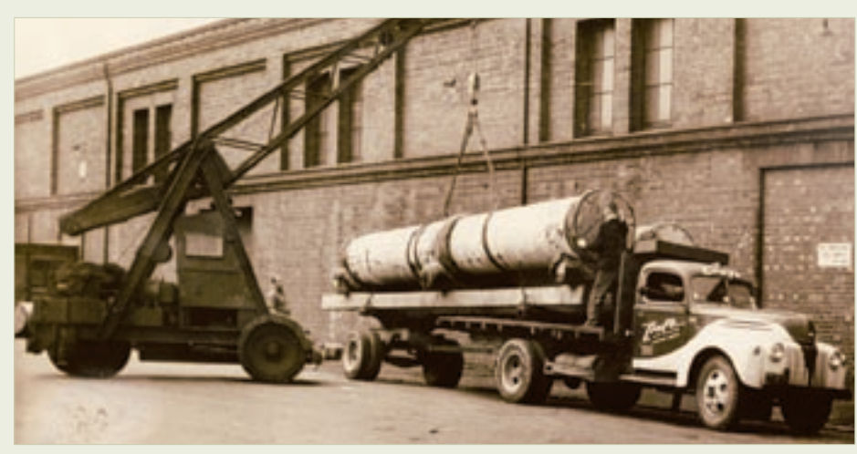
Stewart and Lloyds' steel pipes from Britain being loaded on a truck at Wellington wharf for delivery to Kaitoke, 1950