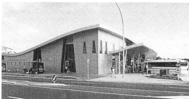
Hamilton's new Transport Centre

Don't miss this inspiring conclusion to our 2001 Conference!