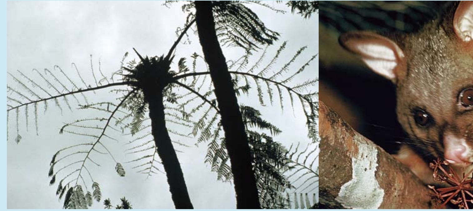
Black tree fern destroyed by possums feeding.