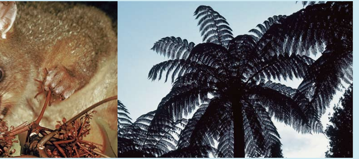
Healthy Black tree fern.

We strongly recommend keeping dogs and cats away from areas where bait is being used. Dogs and cats are susceptible to poisoning from eating bait and can die from secondary poisoning from eating possum carcasses.