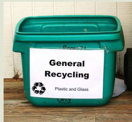
Right: Muritai school's recycling bin

Make an adult responsible for putting out the weekly collection bin for the contractor to pick up.