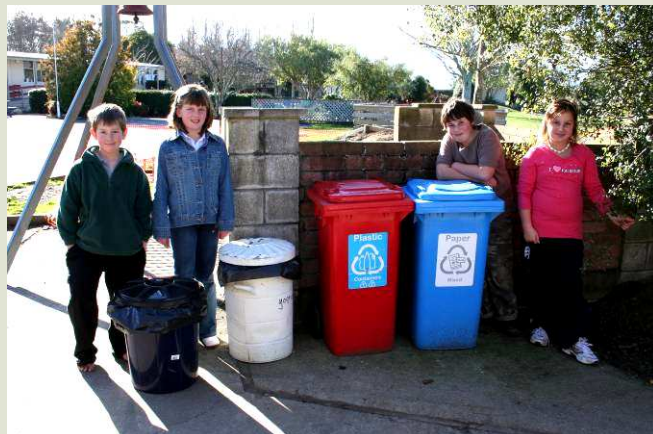
Above: Fernridge school's recycling collection bins in the lunch eating area Bins from left: food scraps bin, reusables, recyclable plastics, paper

Decide where you will store your recycling bins. Consider locking them away at night- they can be a target for vandals.