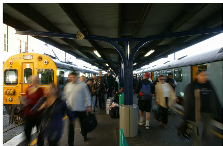
Commuters departing at Wellington Station.