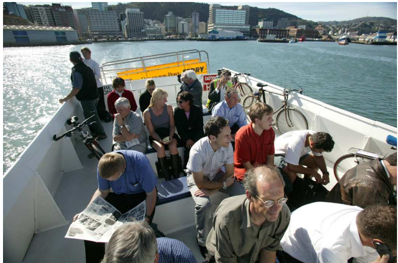
Ferry across Wellington Harbour.

The five phases in a workplace travel plan are outlined below. Each phase is completed when the organisation submits key documents and key milestones are achieved.