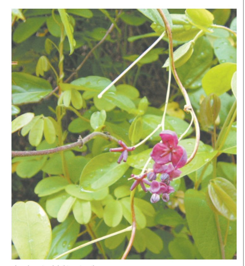
Chocolate vine (Akebia quinata)

For more information on pest plant species, see www.gw.govt.nz (keywords – pest plants). To report any sightings of pest plants, phone Greater Wellington on 04 526 5325 (Upper Hutt), 06 378 2484 (Masterton) or email pest.plants@gw.govt.nz