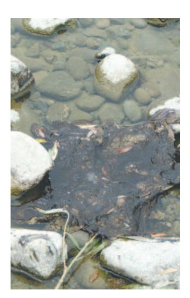
Toxic blue-green algae.

River users are urged to keep an eye out for blue-green algae blooms this summer