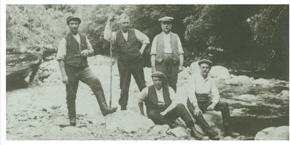
Council waterworks staff at Orongorongo River, February 1915

Providing water at a cost that the population can bear has been a challenge ever since European settlers arrived in the region. Greater Wellington has just published Our water history – on tap , which tells the story of how this challenge was met