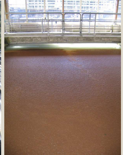
Float layer over filter