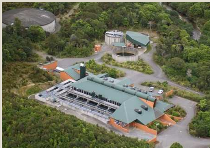
Wainuiomata Water Treatment Plant

For more information, contact Greater Wellington: