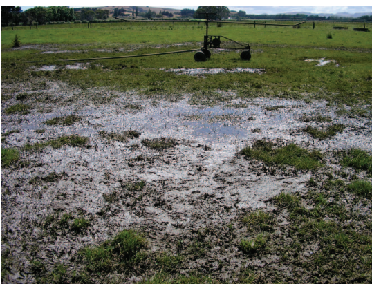
Figure 3: Poor dairy shed effluent management practices resulting in ponding of effluent

The majority of compliance monitoring for water permits was for water extraction for irrigation. During inspections, annual water meter readings were taken to ensure extraction levels complied with consent conditions. In 2007/08, due to below-average rainfall in the Wairarapa, water restrictions were applied. As a result, an additional 120 permits were monitored, with a high level of compliance observed. Permits for municipal water supplies were either fully complying or not assessed for compliance as further data was still required for analysis.