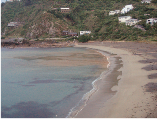
Figure 2: A discharge of leachate to the coastal environment

The majority of compliance monitoring for coastal permits focused on boatsheds and jetties. The level of non-compliance for these activities is similar to previous years, with a key issue being the use of boatsheds as residences, which is not allowed by consent conditions.