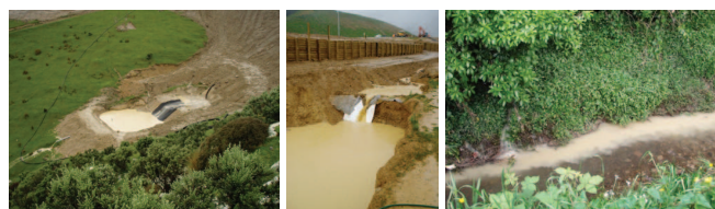
Figure 3: Discharges of contaminants into the environment from earthworks activities

If you notice an environmental incident or an activity you think may have adverse environmental effects, please call Greater Wellington's Environment Hotline on 0800 496 734. This is a 24-hour service and our duty officer will respond within an hour on most occasions.