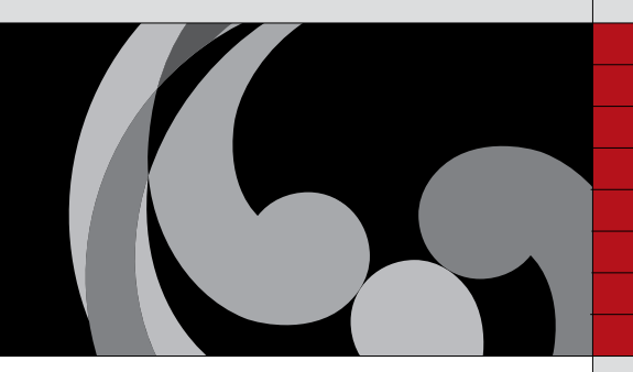
FIGURE 3 Key strategic plans