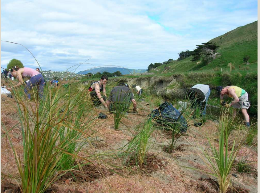
BP and IAG volunteers plant native grasses beside Kakaho Stream