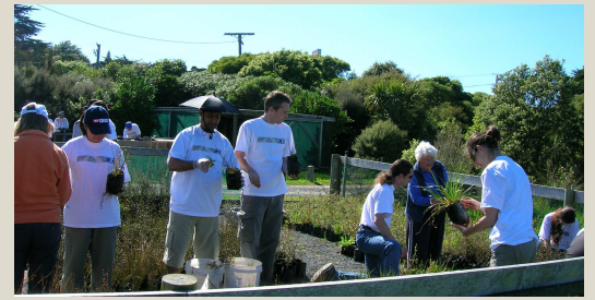
NZI help out at the community nursery in Pauatahanui