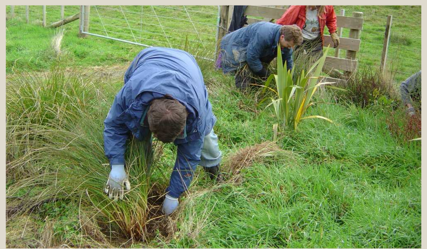
Westpac volunteers release native plants at Battle Hill Regional Park

Your corporate group can help to restore sand dunes, wetlands, stream sides or estuaries.