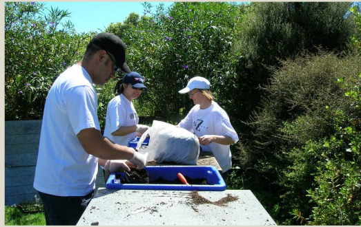
NZI volunteers bagging up native plants

There are enjoyable activities for everyone – it's not all hard work!