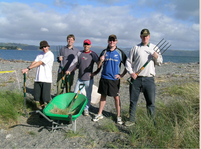
ERMA volunteers prepare to control marram grass at Eastbourne Beach