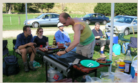
BP and IAG volunteers take a break while planting at Kakaho Stream

Please note that Occupational Safety and Health liability rests with your organisation. Greater Wellington will however ensure that: