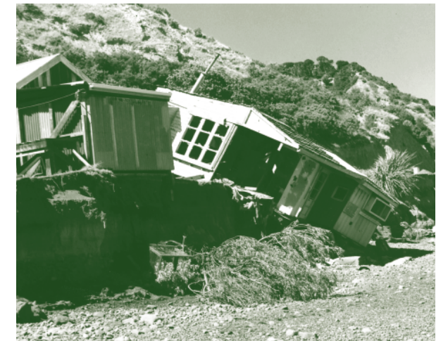
A Palliser Bay house claimed by the sea.

To minimise the risk, don't locate any valuable permanent assets too close to the water, and consult your local council for information related to coastal erosion for your property.