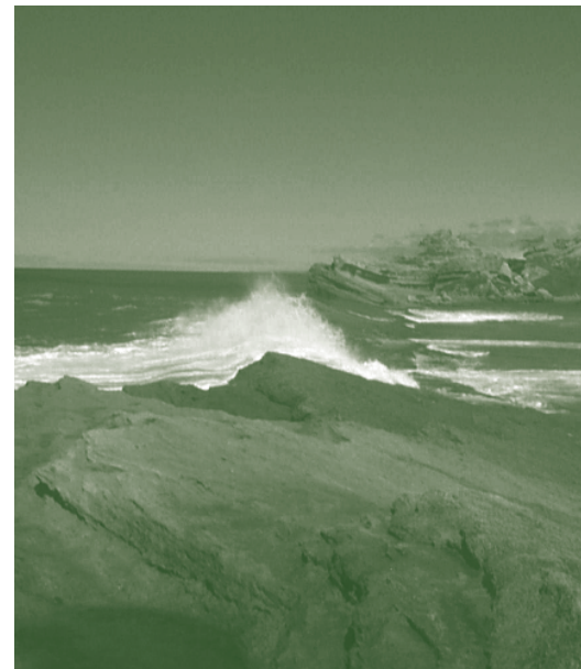
A wave overtops the reef and popular fishing platform at Castlepoint

For more information on what you can do contact Greater Wellington, or your local council or consult the Wairarapa Coastal Strategy document entitled Caring for our coast – a guide for coastal visitors, residents and developers . Included in these guidelines are more detail and advice on reducing the risk from hazards and carrying out hazard assessments