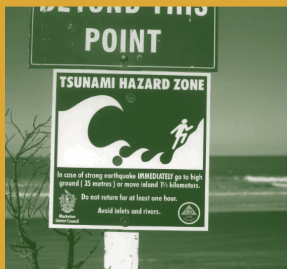
Signs like this have been placed around the Wairarapa coast warning people of the tsunami dangers and advising what to do when you feel an earthquake.

Read our fact sheet tsunami hazard for further information.