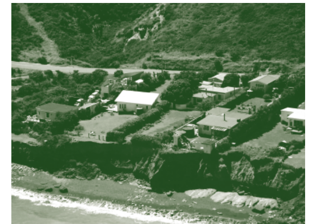
Cape Palliser Road and several houses have been lost to the sea due to erosion in eastern Palliser Bay.