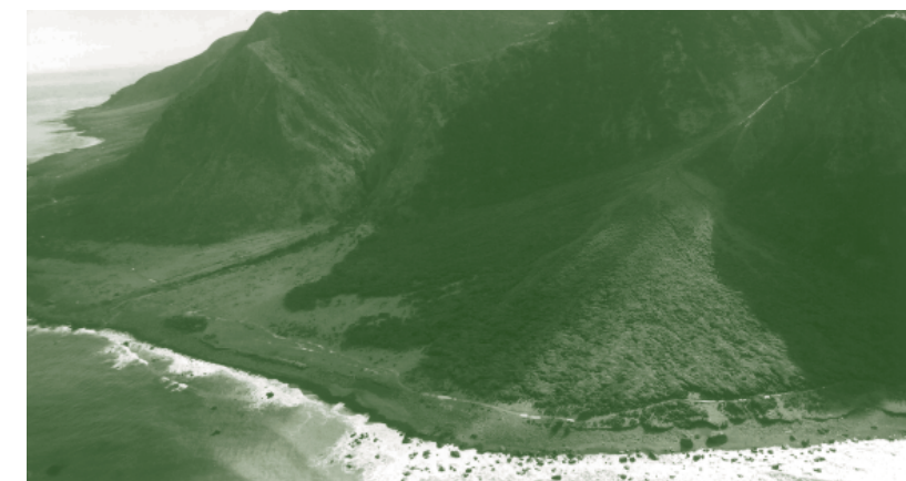
During high rainfall events, streams on fans such as this can leave their course and flow randomly, causing damage from flooding, scouring and deposition. This has happened in the past at Ngawi.

The steep nature of much of the Wairarapa coast can also lead to slope hazards such as rock falls and rainfall related problems such as river scour, unwanted deposition of debris and flooding. Developments close to or on steep slopes or depositional fans (see photograph below) should have the risks assessed early by a professional as part of the development programme.