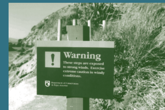
Watch out for signs like these warning people of the hazards associated with recreation on the coast.