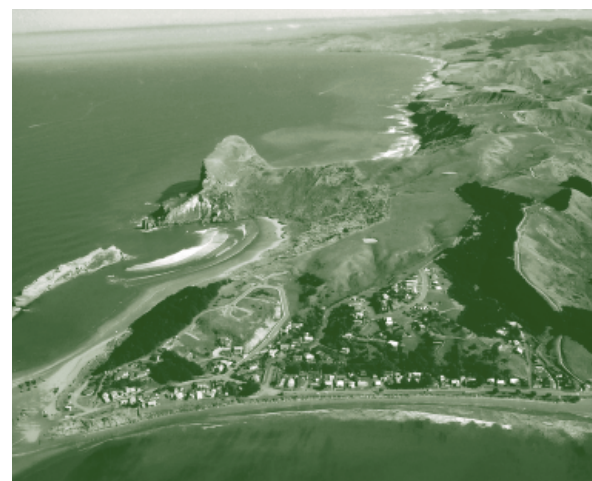
Ngawi and Castlepoint are two of the Wairarapa communities vulnerable to tsunami due to their relatively low elevation and exposure to tsunami generating sources.