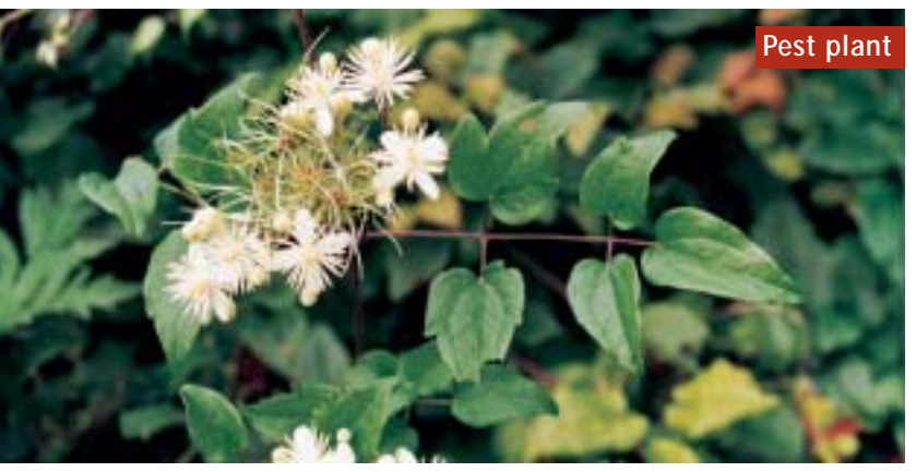
Old man's beard Clematis vitalba

Don't plant exotic climbers close to bush margins.