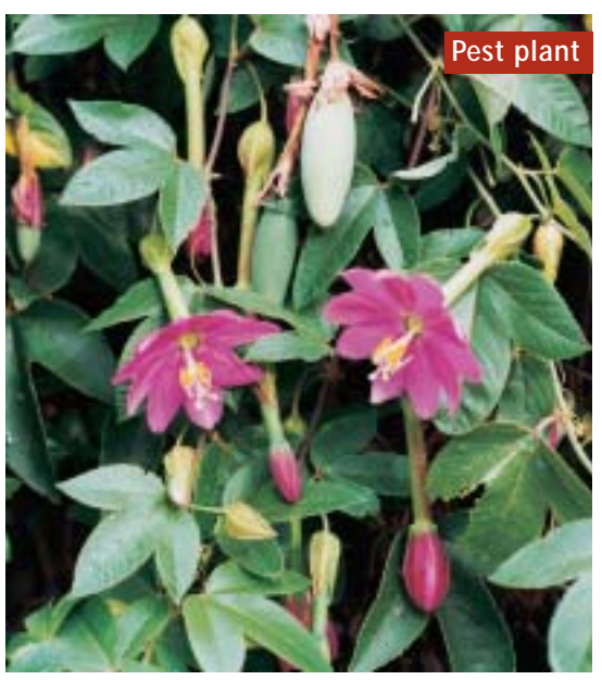
Banana passionfruit Passiflora tripartita varieties, P. tarminiana, P. mixta

A sprawling deciduous vine with twining stems and extensive underground rhizomes. Often referred to as convolvulus. Large trumpet shaped white flowers and arrow shaped leaves. Pink bindweed has pink flowers.