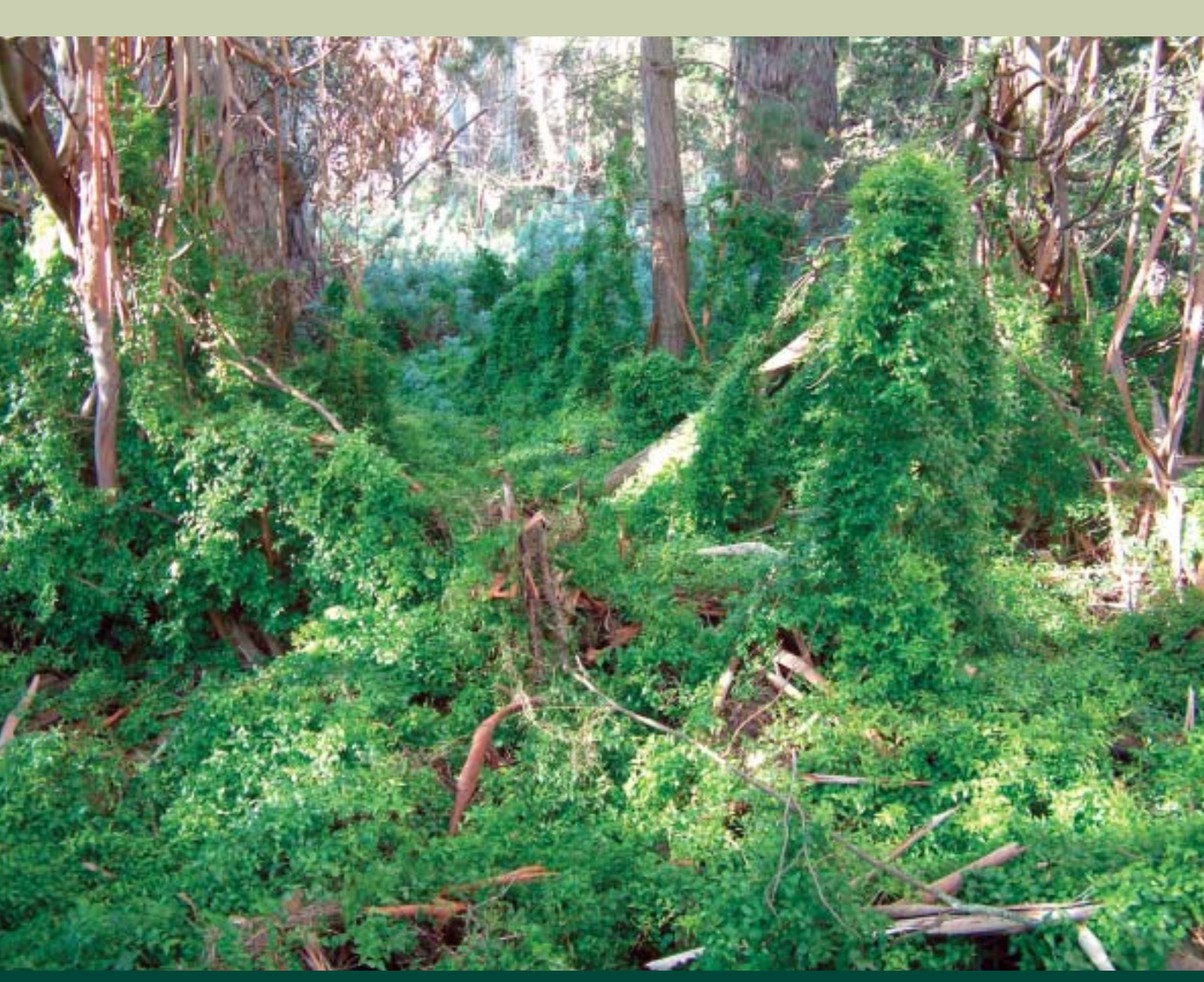
Infestation of smilax near Martinborough