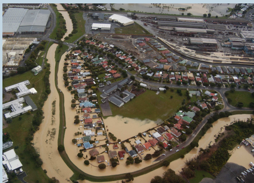
Riverside Drive, Waiwhetu 16, February.

On the morning of 17 February Miramar received a period of short but intense rainfall. This caused some surface flooding in the township and some low-lying streets.