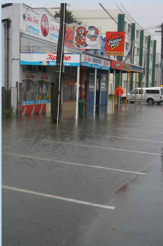
Surface flooding in Park Avenue, Miramar, 17 February

On the morning of 17 February Miramar received a period of short but intense rainfall. This caused some surface flooding in the township and some low-lying streets.