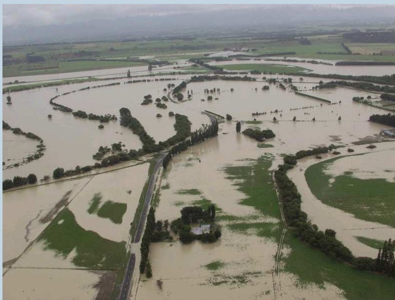
Looking west up SH 53 towards the Ruamahanga Bridge, 16 February

The recent floods that devastated many parts of the lower North Island in February also caused damage to houses, roads and farm property in the Wairarapa. Civil defence staff in the region were on alert from 15-17 February, monitoring the situation and co-ordinating road closure information to help drivers negotiate Wairarapa roads, 35 of which remained closed for up to 36 hours due to flood waters. Heavy and persistent southerly rain, particularly in the eastern hills and Rimutaka Ranges, caused the Ruamahanga River to flow at its highest ever-recorded level.