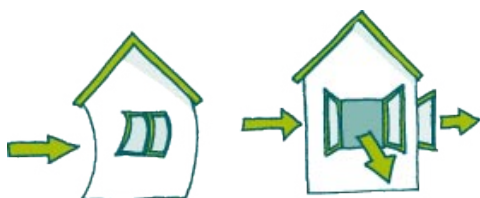
Open downwind windows to relieve pressure on the roof