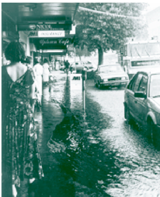
Masterton flooding

Do not light fires as they may get out of control.