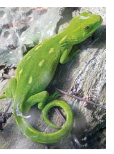
Green punctatus gecko