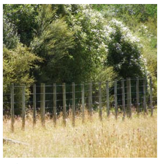
Well-fenced plantings on a stream margin

In the long term, not only will the stream be healthier and much more attractive, you will also see more native birds in the neighbourhood. The stream will have cleaner water that will be more palatable to stock. You may even find that the stream becomes a feature that adds value to your property.