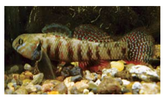
Male redfin bully

evidence from streamside planting projects around the region indicates that if the few open areas of the stream are planted, there will be measurable improvements to its overall ecological health.