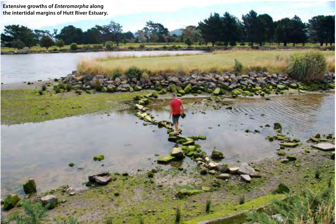
Extensive growths of Enteromorpha along the intertidal margins of Hutt River Estuary.