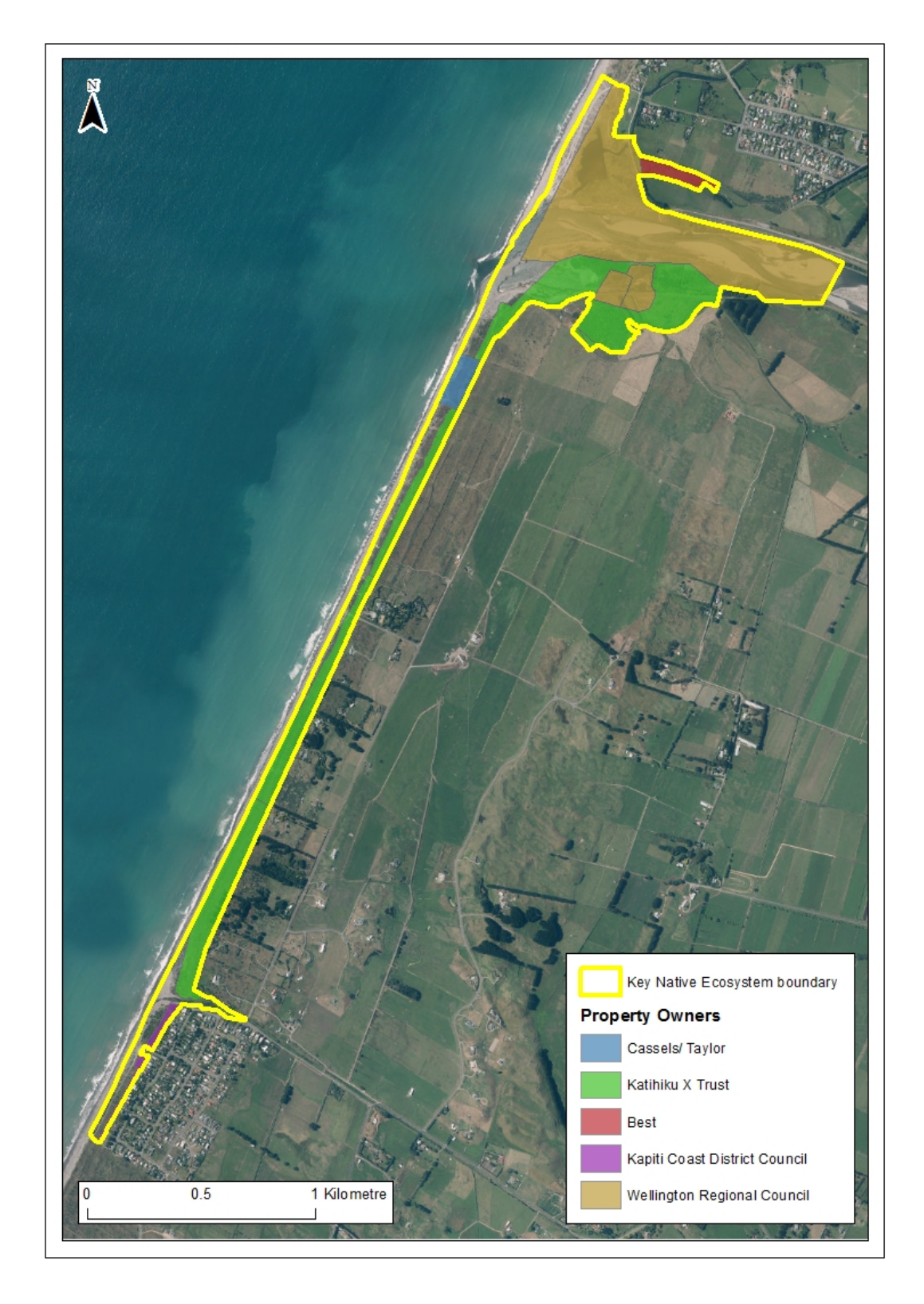
Map 2: Property ownership at Ōtaki Coast KNE site