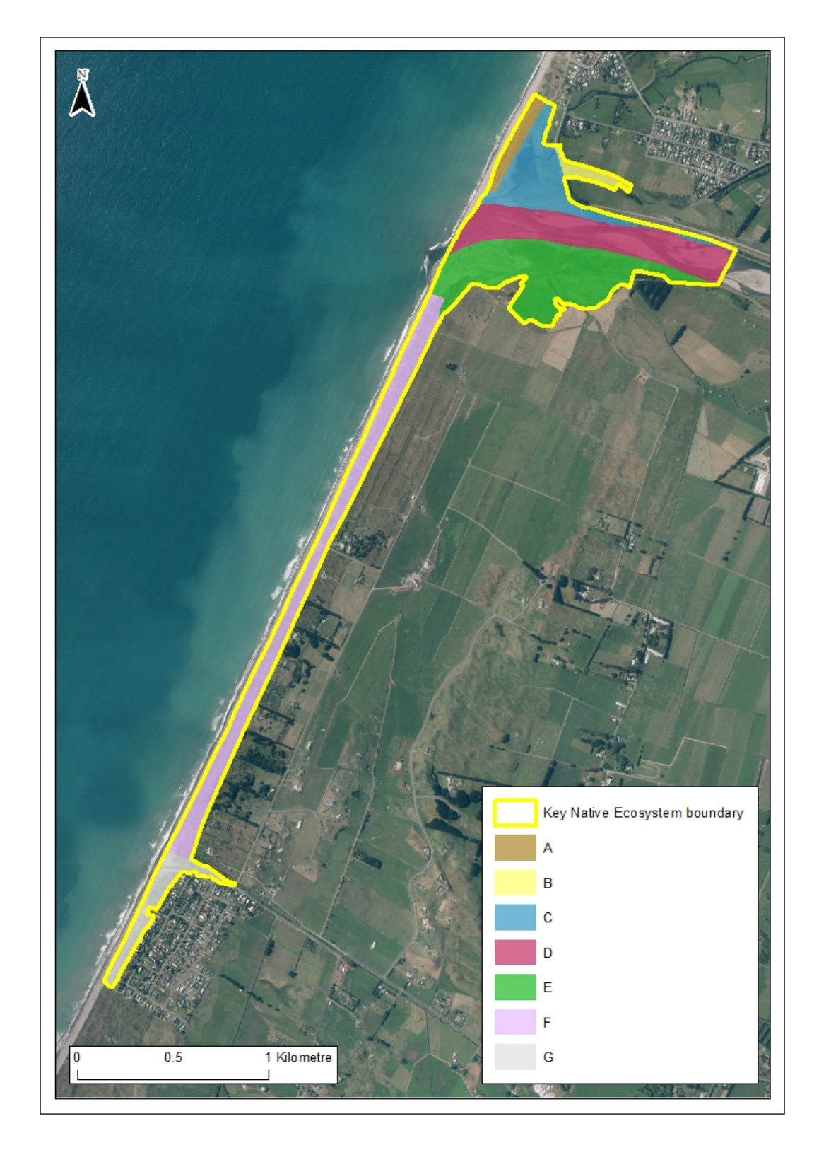
Map 4: Operational areas in the Ōtaki Coast KNE site