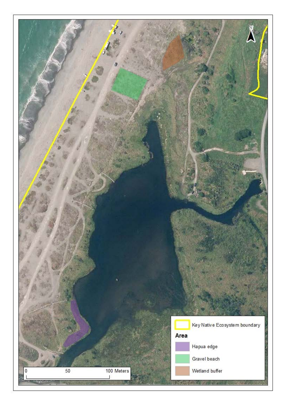
Map 7: Revegetation areas in the Ōtaki Coast KNE site