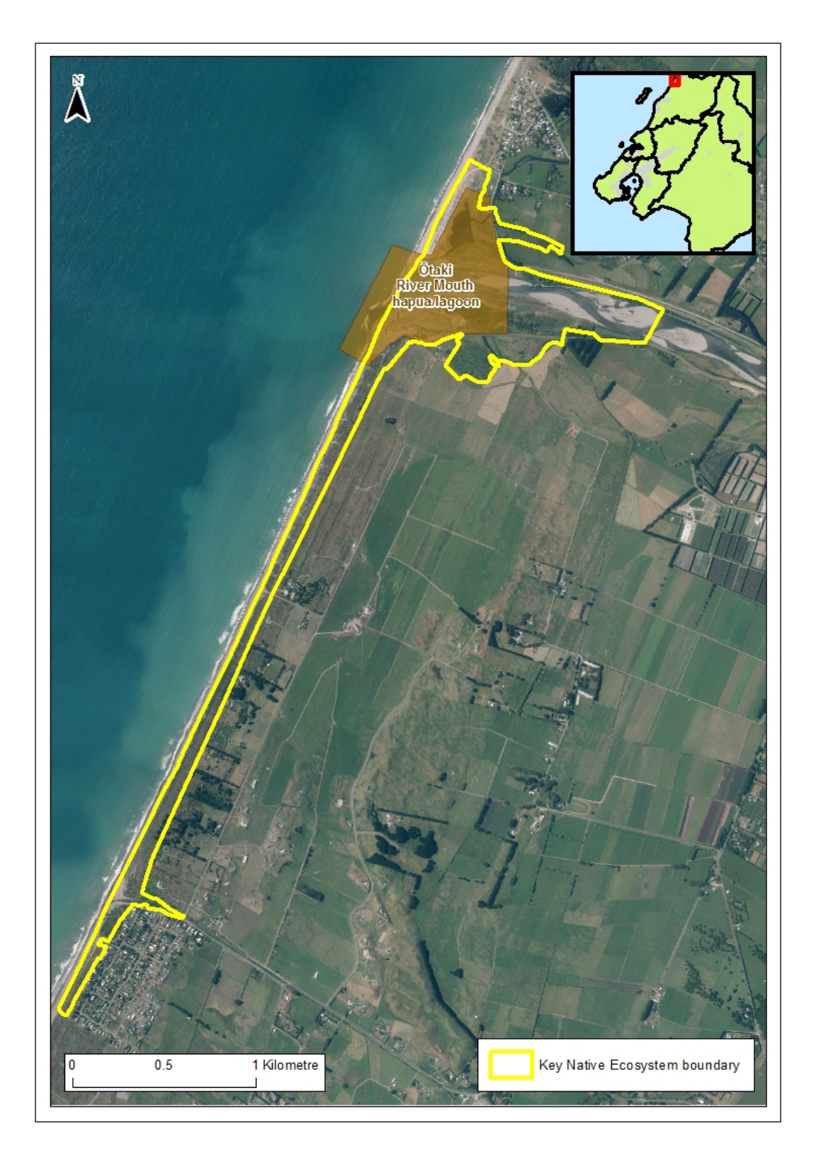
Map 1: The Ōtaki Coast KNE site boundary and location of hapua