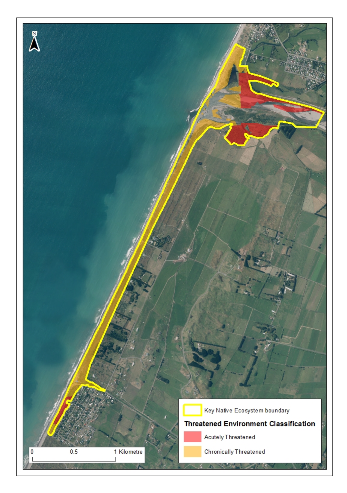
Map 3: Land Environment New Zealand threat classifications for the Ōtaki Coast KNE site