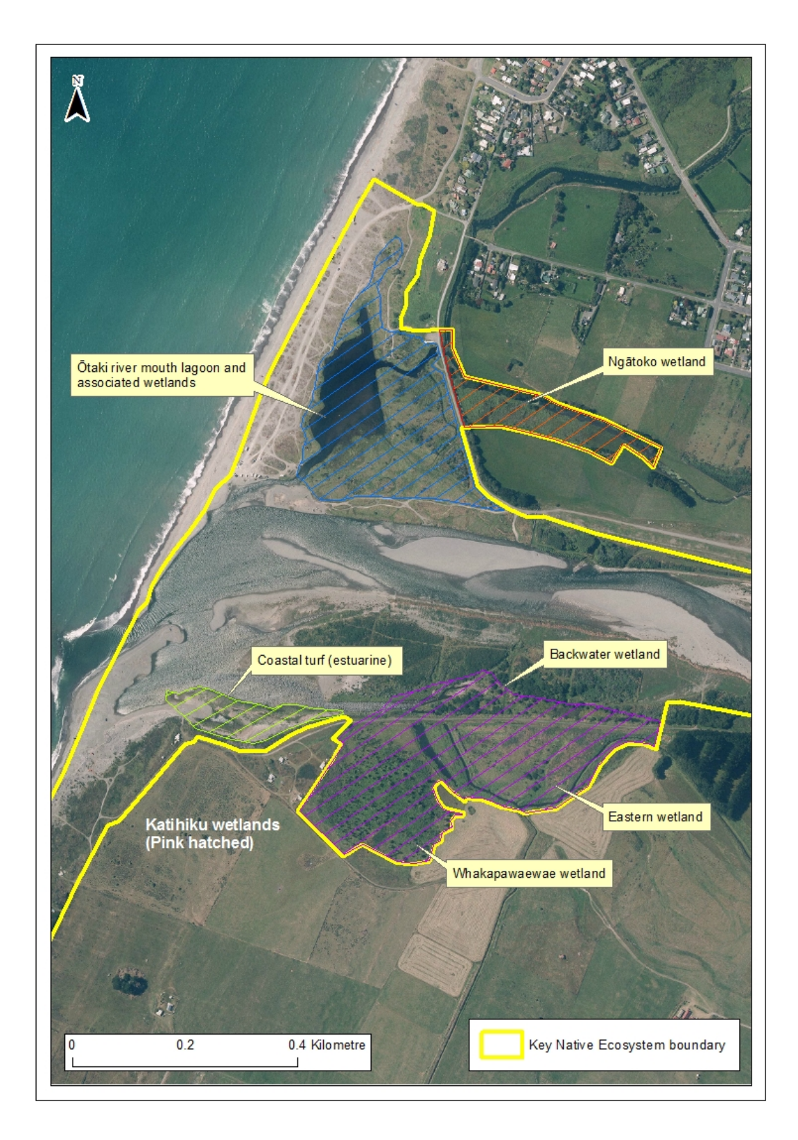
Map 5: Key wetland habitats located around the Ōtaki river mouth at Ōtaki Coast KNE site