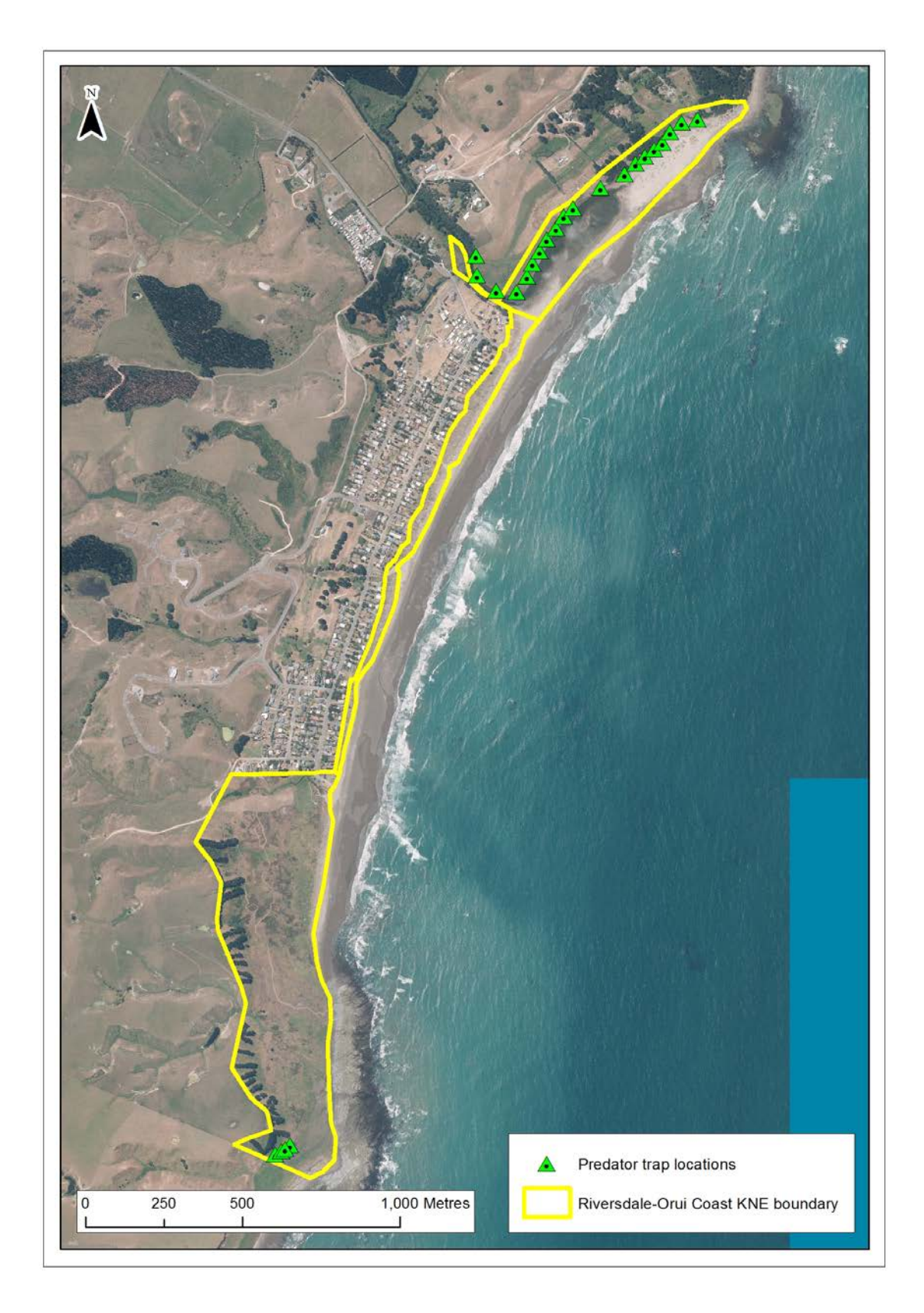
Map 3: Pest animal control locations in the KNE site