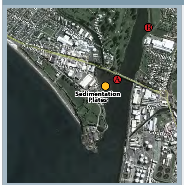
Figure 1. Location of intertidal sediment plates and fine scale monitoring sites in the lower Hutt Estuary.

Prepared for Greater Wellington Regional Council by Leigh Stevens, Wriggle Coastal Management, April 2017