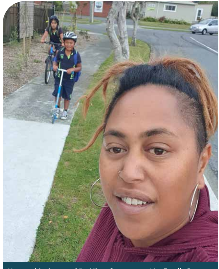
You could win one of 5 x Micro Scooters or 10 x Family Passes to fun Wellington destinations. Competition runs 1-31 March.