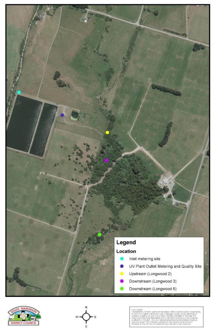
Figure 1: Indicative WWTP flow and water quality monitoring site locations