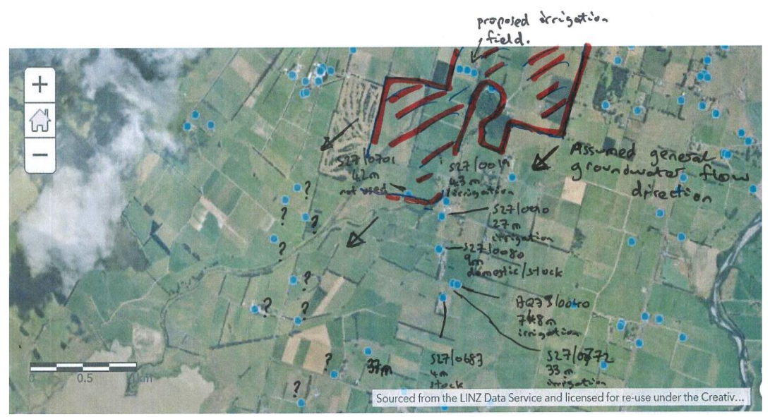
Figure 2: Screenshot from public GIS data showing location of wells in vicinity of site. Well numbers and details of select wells marked. I do not purport this to be a comprehensive assessment of the study area. Rather, the purpose of this figure is to demonstrate the sort of detail I would have expected to see the AEE for risk assessment purposes.

32. Using well S27/0080 as a reference environmental receptor then from the results of the microbial transport assessments I make above, whilst the risk is perceivably low, I would not rule out potential for the water quality of this well to be at risk of being impacted by pathogens from the proposal.