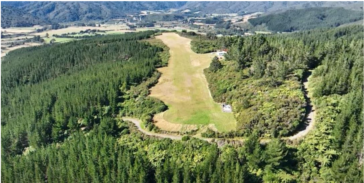
Former glider club runway open space and access track. There will be temporary disruption to access in future when the surrounding plantation forest is harvested.

We welcome your questions. Please email parksplanning@gw.govt.nz or come along to an open day if one is organised. You can also phone the Pākuratahi Park Ranger via our Contact Centre - 0800 496 734.