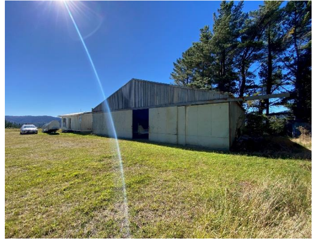
Former glider club hut and hanger. Both require extensive upgrade and consenting works before they can be reused for other compatible park purposes.