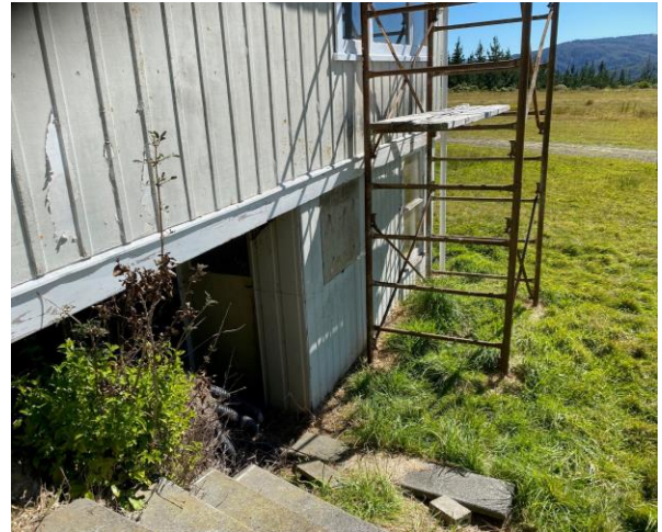
There is a generator shed beside the hangar. There is a storage room underneath the club hut, at full ceiling height.