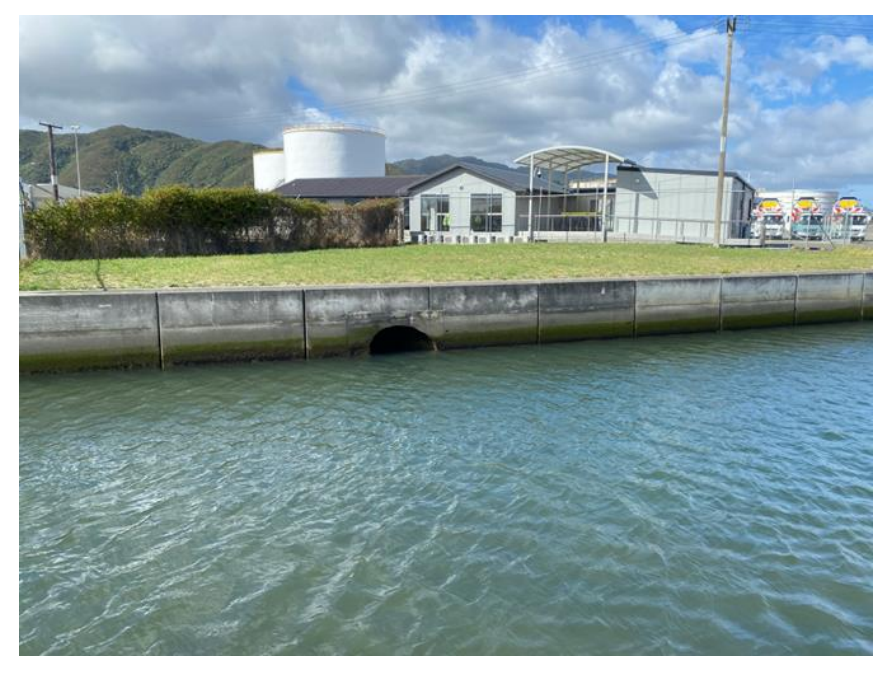
Figure 13: Location of the Seaview Wastewater Treatment Plant wastewater discharge to the Waiwhetū Stream.

69. Treated wastewater is also discharged to the Waiwhetū Stream when the Seaview Wastewater Treatment Plant is beyond capacity. This can be due to stormwater