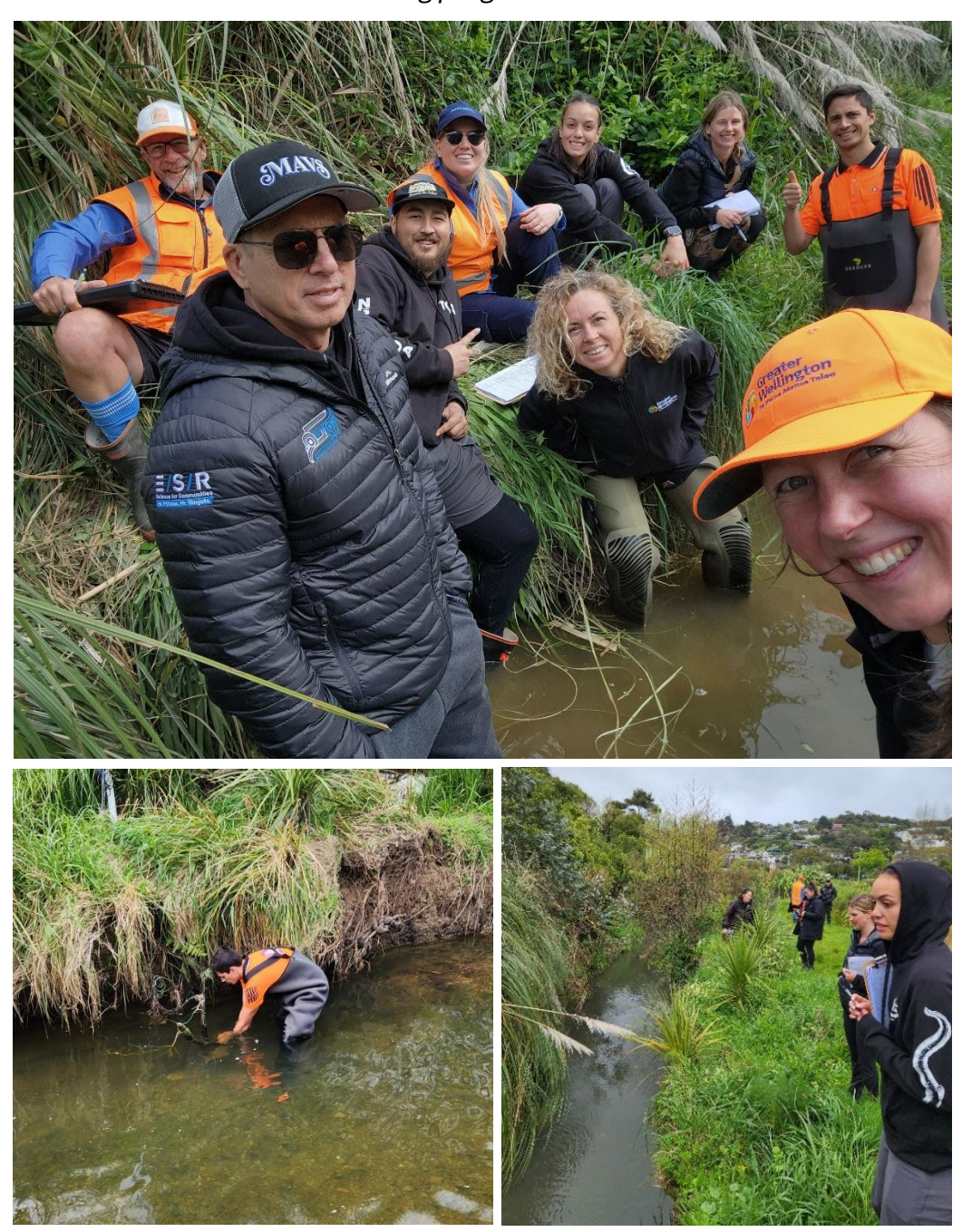
Figure 5,6 & 7: Representatives from ESR, TRoTR, PCC, Greater Wellington and Mountains to Sea Wellington taking part in Wai Māori o Porirua monitoring