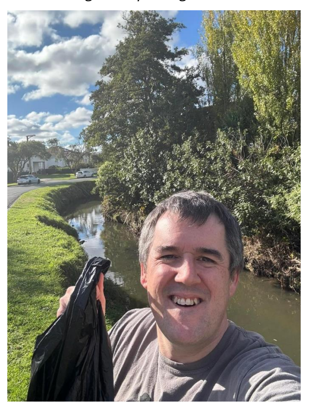
Figure 12: Hon Chris Bishop, MP for Hutt South and member of the Friends of the Waiwhetū, at a stream cleanup in May 2024.

The challenge of improving urban streams – Waiwhetū FMU