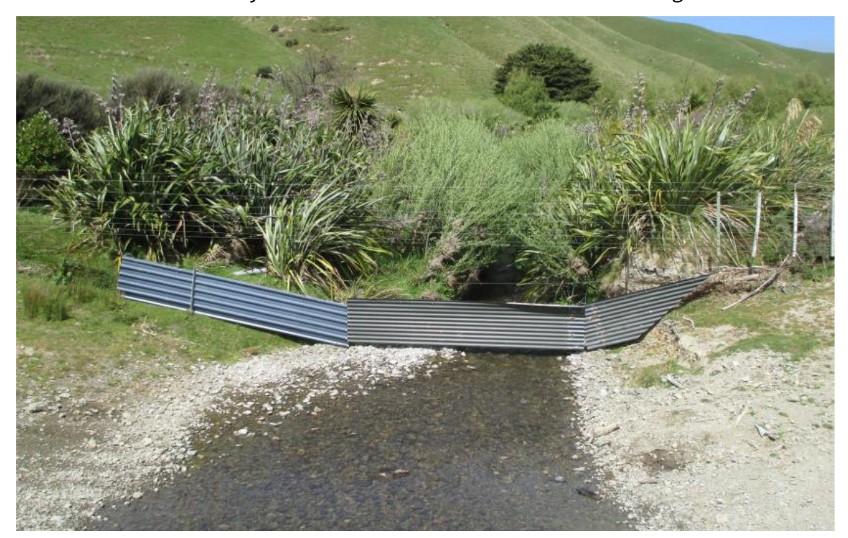
Figure 9: An example of riparian planting on-farm as part of good land management practice