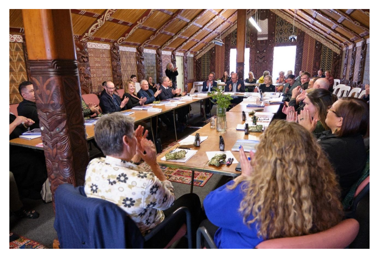
Figure 16: Council receiving Kāpiti Whaitua Implementation Programme