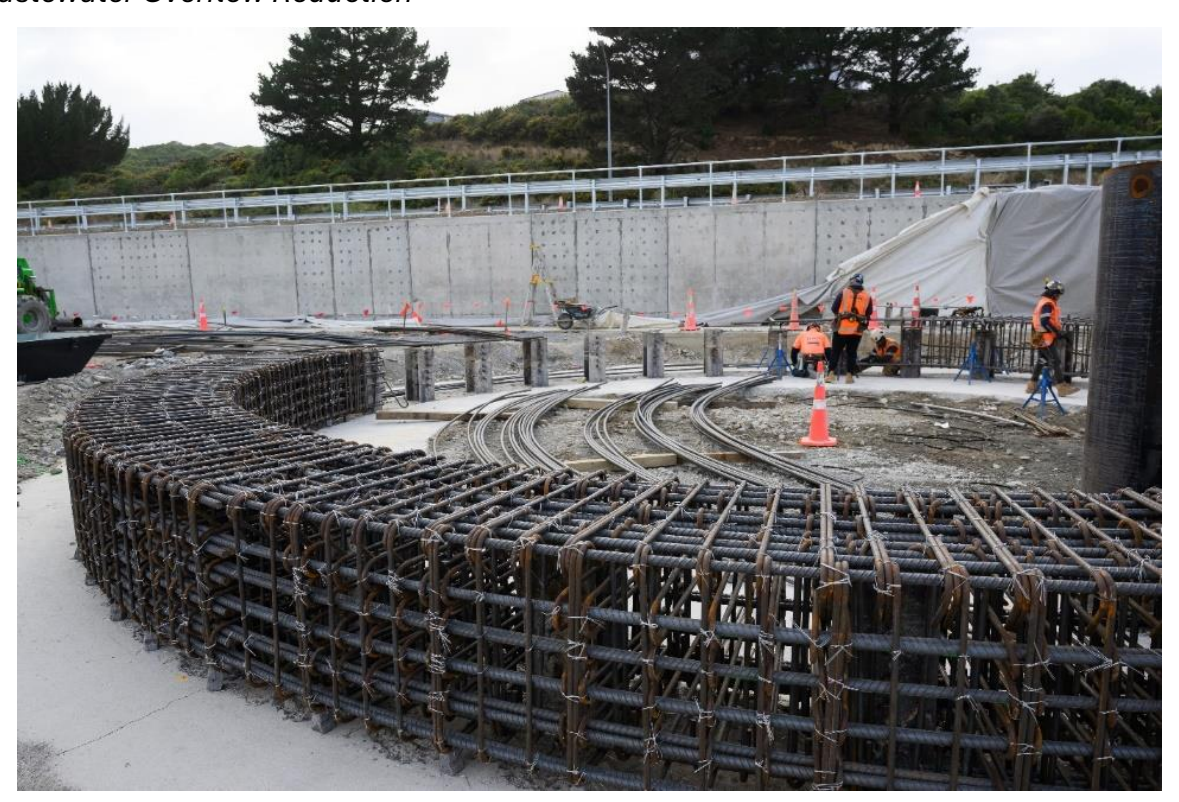
Figure 11: Porirua Wastewater Retention Tank Construction

51. Construction is in full swing of the Porirua CBD Wastewater Retention Tank and the Bothamley Park Wastewater Main Upgrade. These projects have a combined value of over $165 million and will significantly reduce the frequency and volume of wastewater overflows into the harbour.