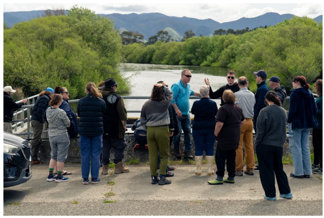
Image 1: Greater Wellington staff lead a discussion on how a review of the Lower Wairarapa Valley Development Scheme can support cultural outcomes and enhanced freshwater values.

Enhancing Wairarapa Moana through a review of the development scheme