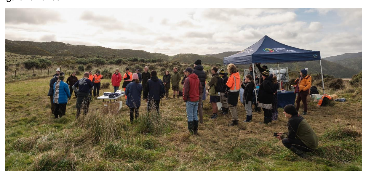
Figure 14: Rōpu Tiaki planting day at Parangarahu Lakes, July 2024.

74. The Parangarahu Lakes are co-managed with Taranaki Whānui and Greater Wellington through Rōpū Tiaki. Te Mahere Wai added ten recommendations for the