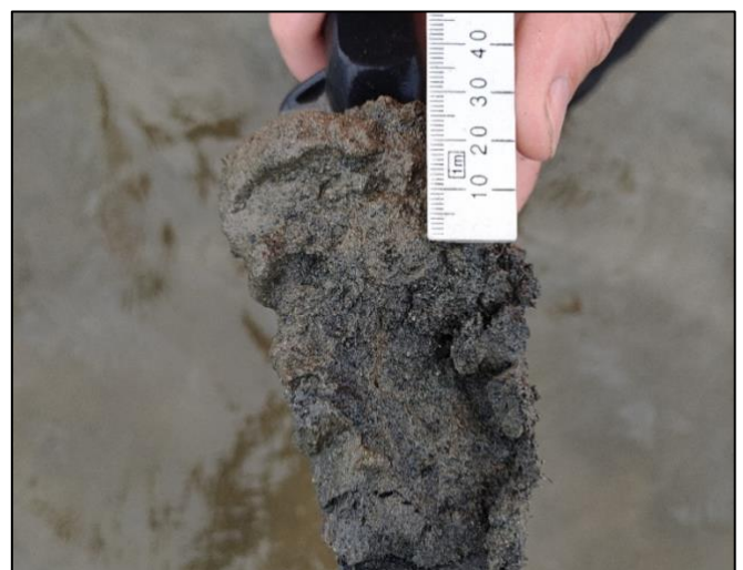
Example of moderately well-oxygenated sediment at Site A, December 2023.

Note: Grain size results are based on replicate composite samples (n=3) taken with the fine scale monitoring (2010-2012, 2017, 2023) or a single composite sample. Indet. = indeterminate.