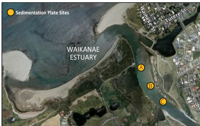
Fig. 1. Location of Waikanae Estuary monitoring sites.

Since 2010, Greater Wellington Regional Council has undertaken annual State of the Environment (SOE) monitoring in Waikanae Estuary to assess trends in the deposition rate, mud content, and oxygenation of intertidal sediments. Monitoring is conducted at three sites (A to C, Fig. 1) with the most recent results collected on 15 December 2023 summarised here.