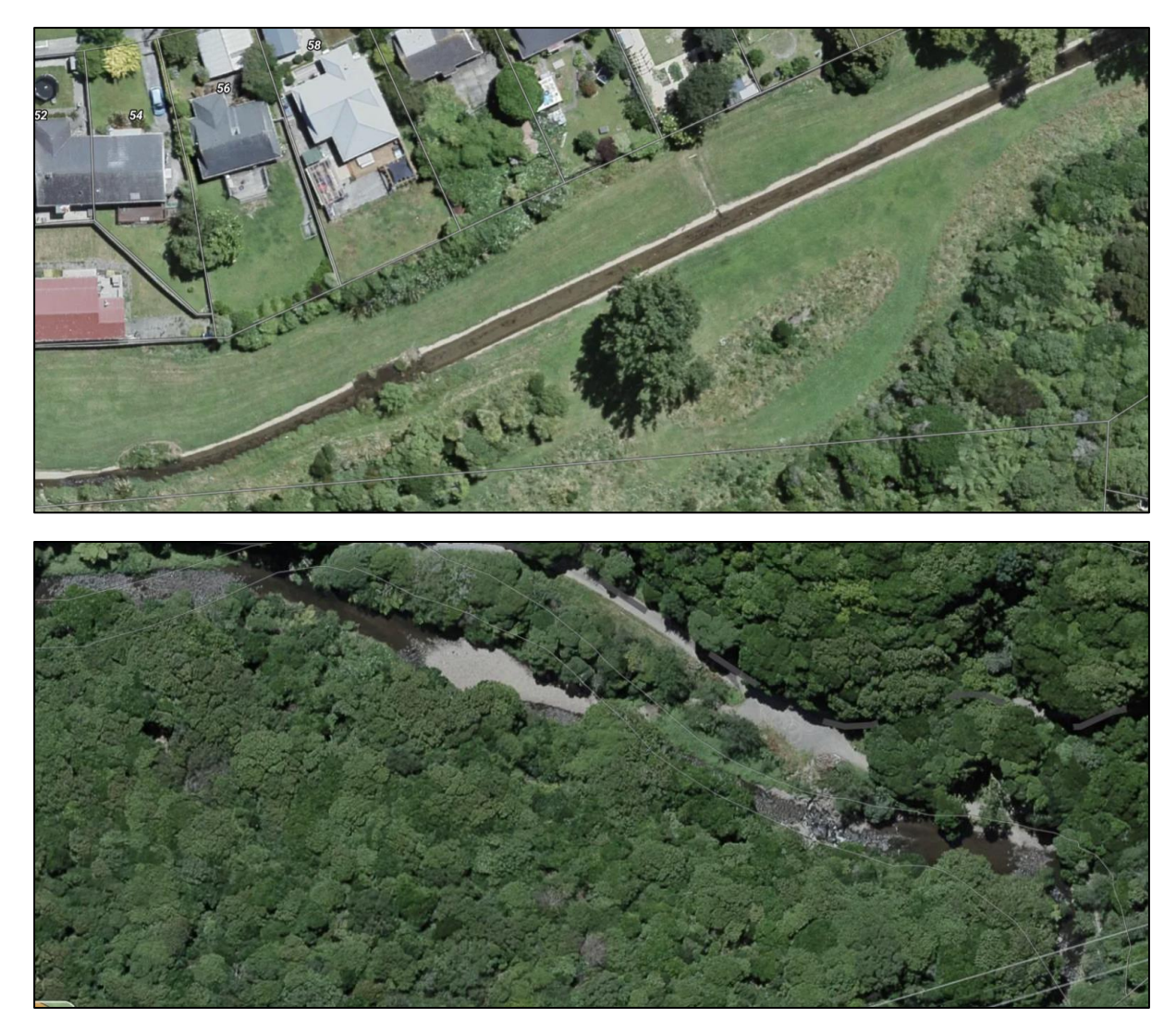
Figure 3: A comparison of a reach of river with low natural form and character, and habitat, values (Waiwhetu Stream, top) and a reach with high natural form and character, and habitat, values (Kaiwharawhara Stream, bottom).

28. It is also well-established that many of the large-scale catchment variables that influence natural form and character and habitat also have a significant influence on other components of ecosystem health, such as water quality. For example, changing land uses can increase nutrient levels from fertiliser use and stock effluent, and increase sediment loads as a result of vegetation removal, cultivation, and livestock access to waterbodies (which can destabilise river banks); loss of riparian vegetation can increase light and temperature as a result of lost shading; and loss of vegetation and increased coverage of impermeable surfaces can cause changes to catchment hydrology (Allan, 2004; Matthaei et al., 2006; Townsend, Uhlmann, & Matthaei, 2008).